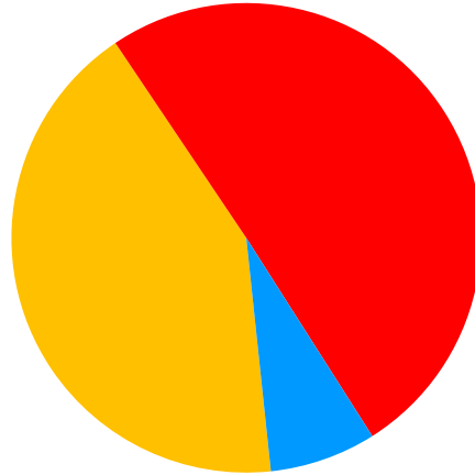
■ General Fund ■ External Reserve ■ Internal Reserve