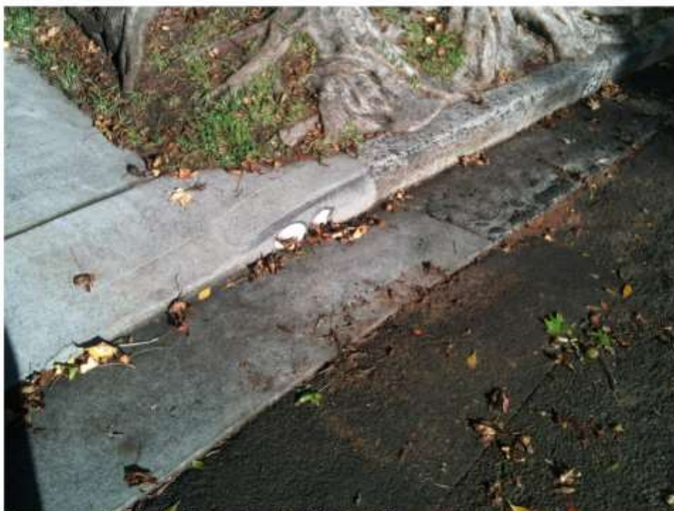
Stormwater pipes had to be replaced in PVC plastic because of tree root damage