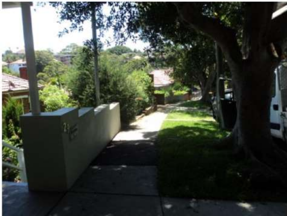
Fig tree roots regularly lift footpath slabs and have dislodged carport support pier