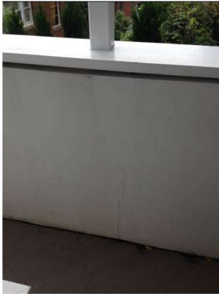
Crack in wall of carport supporting pier also caused by fig tree roots