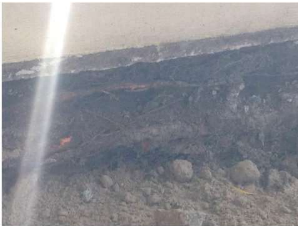
Tree roots run along the entire length of the front brick fence and retaining wall