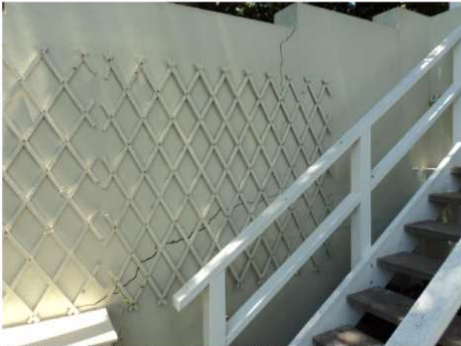
Cracks in wall extend down to water and gas meter boxes at bottom of entranceway