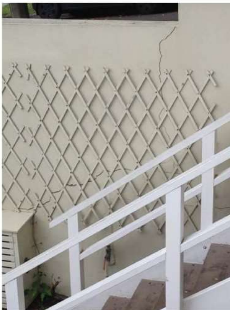
Cracking in property retaining wall caused by Council fig tree roots