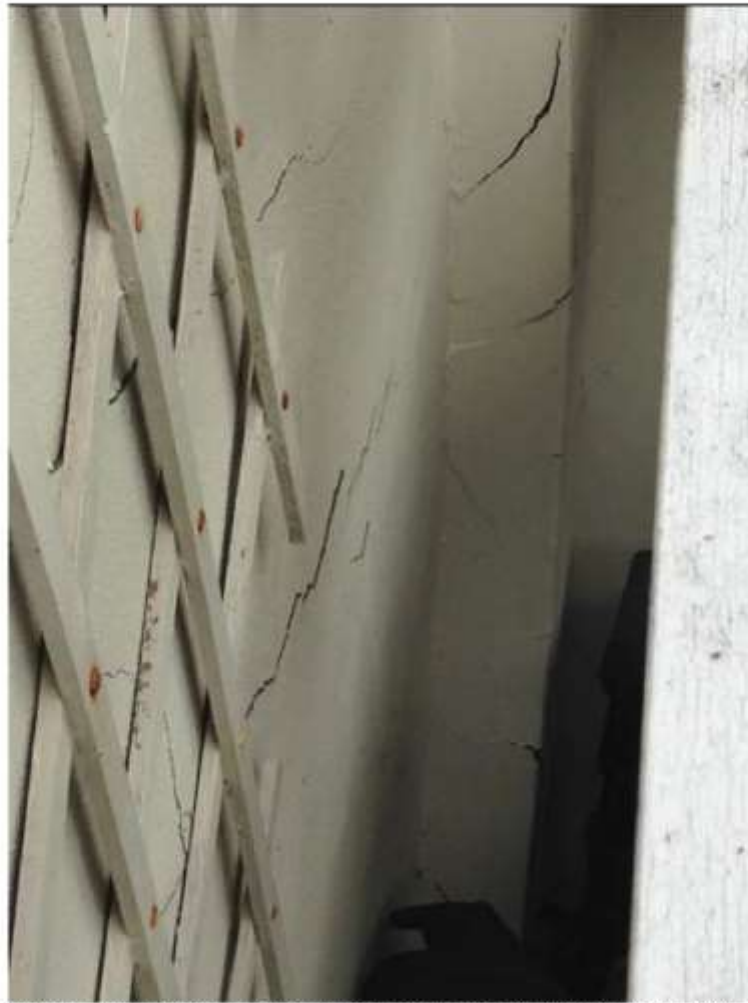
Cracks in pillar and retaining wall inside the front of adjacent property