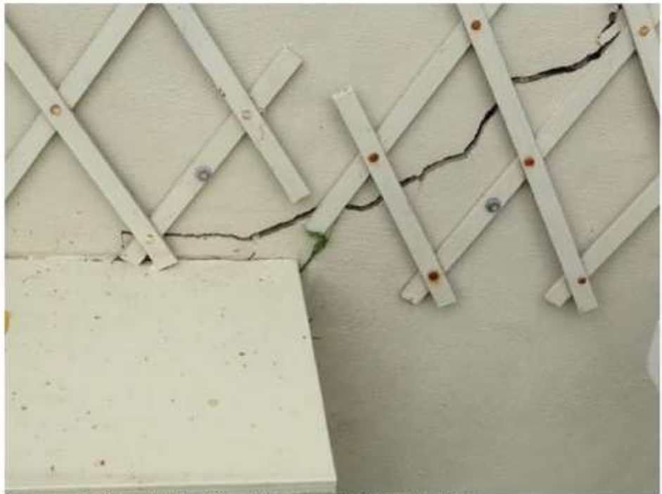
Large cracks immediately adjacent to gas and water meter boxes