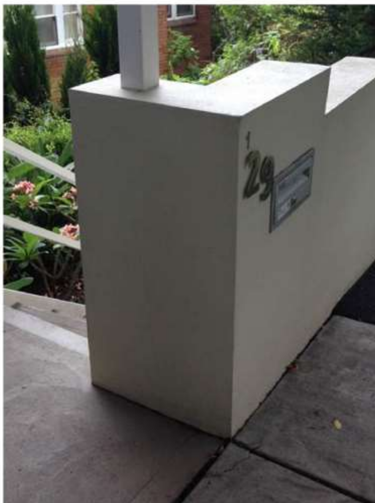
Damage to front wall and driveway where mailbox butts up to footpath