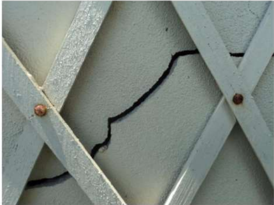
Excessive cracking caused to front brick retaining wall by adjacent fig tree roots