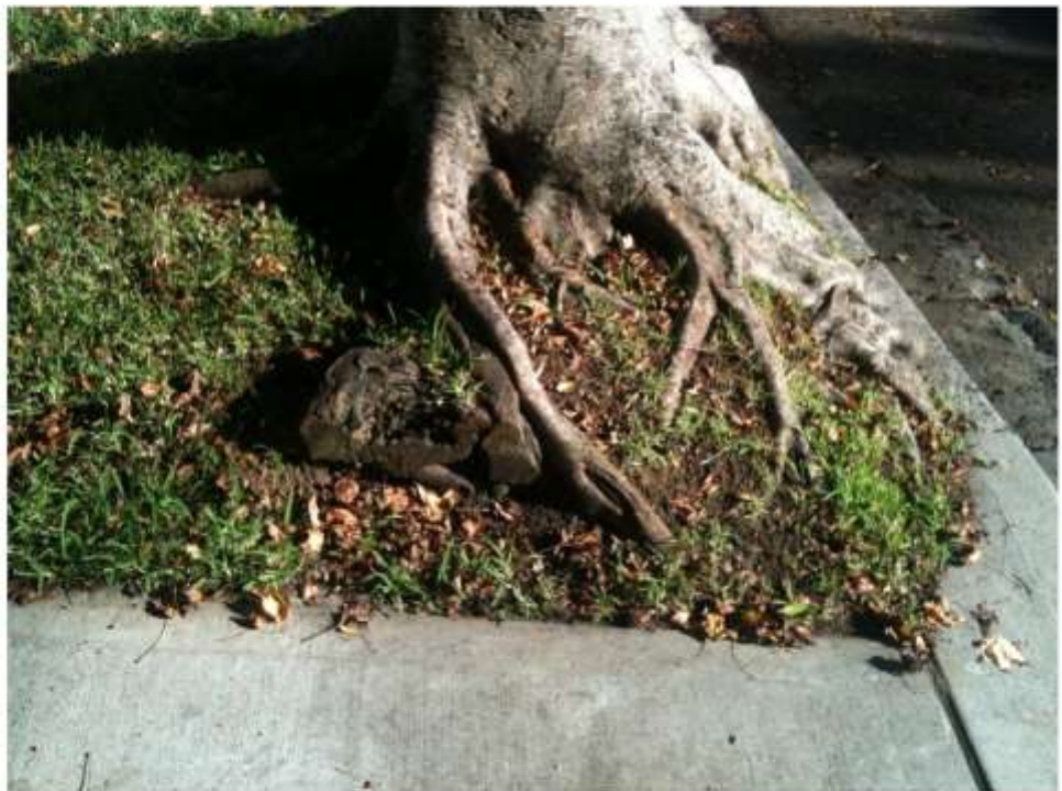
Major fig tree root had to be severed to allow damaged driveway to be replaced