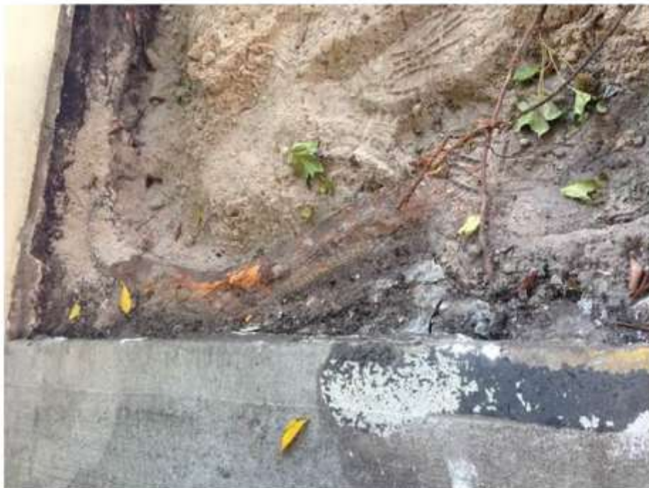
Large fig tree root located adjacent to driveway and front brick fence of property