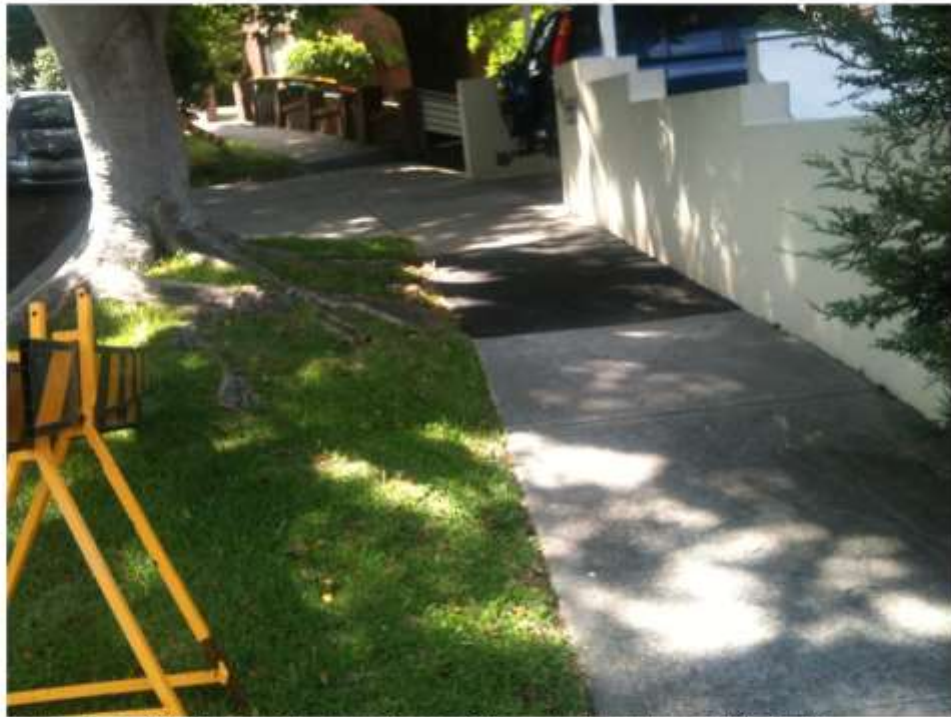
Large mass of buttress roots around base of tree running underneath footpath