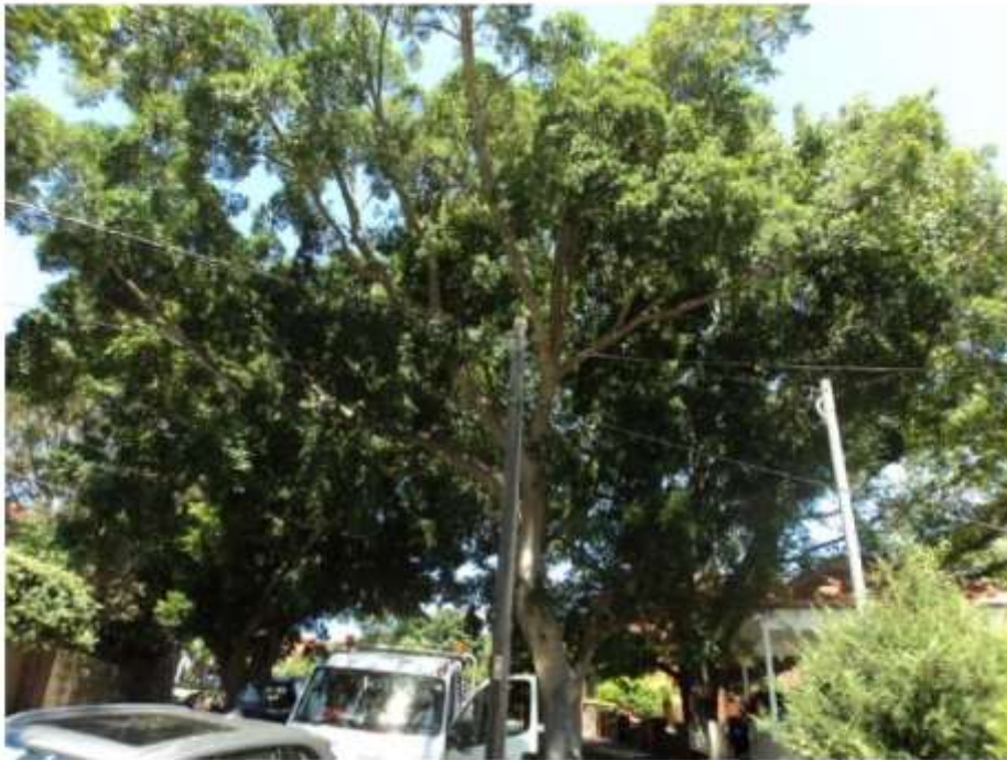
Hill's Weeping fig is healthy and prominent in the Ritchard Ave streetscape