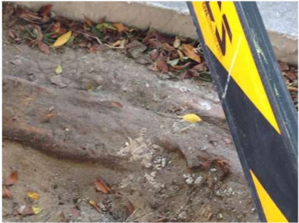
Large root located underneath footpath cannot be severed because of proximity to tree