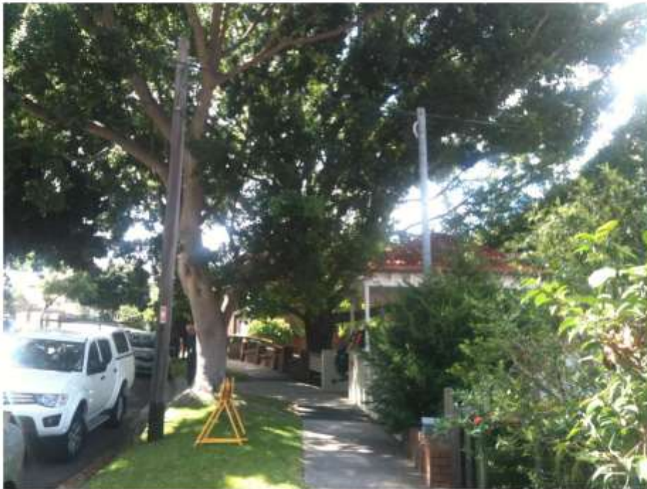
Canopy has to be regularly pruned away from domestic service wires