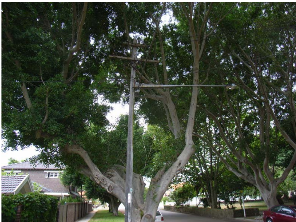
Street light situated immediately adjacent to tree