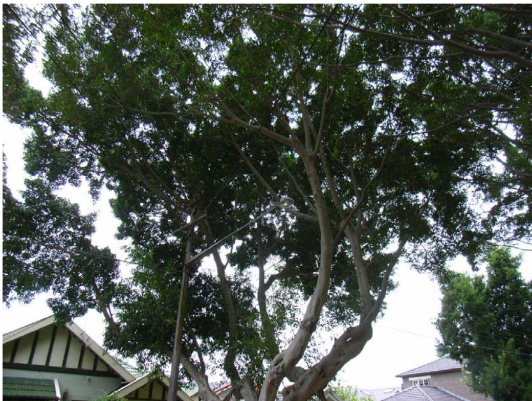
Streetlight surrounded by branches