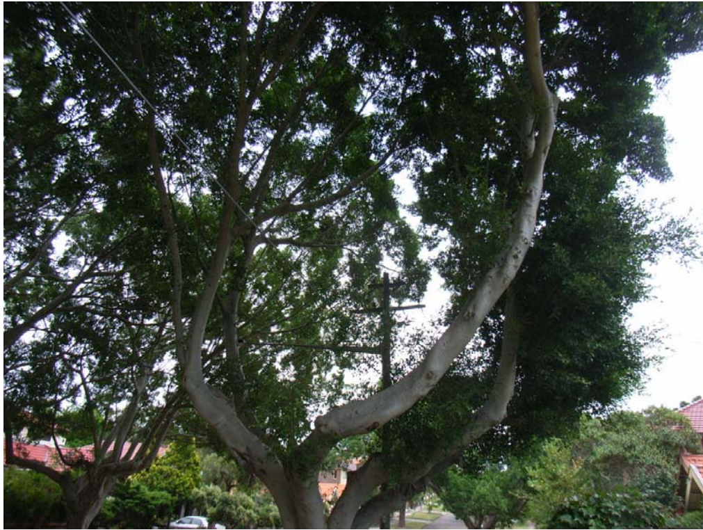
Canopy has to be pruned around powerlines