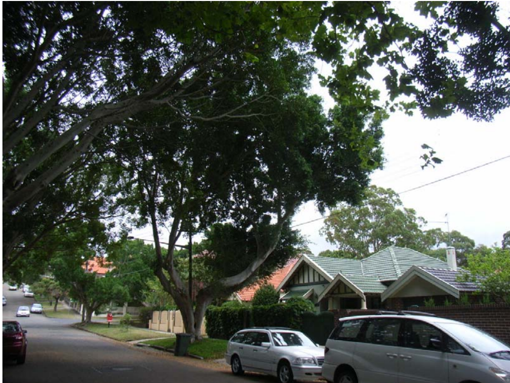
Tree is significant in streetscape