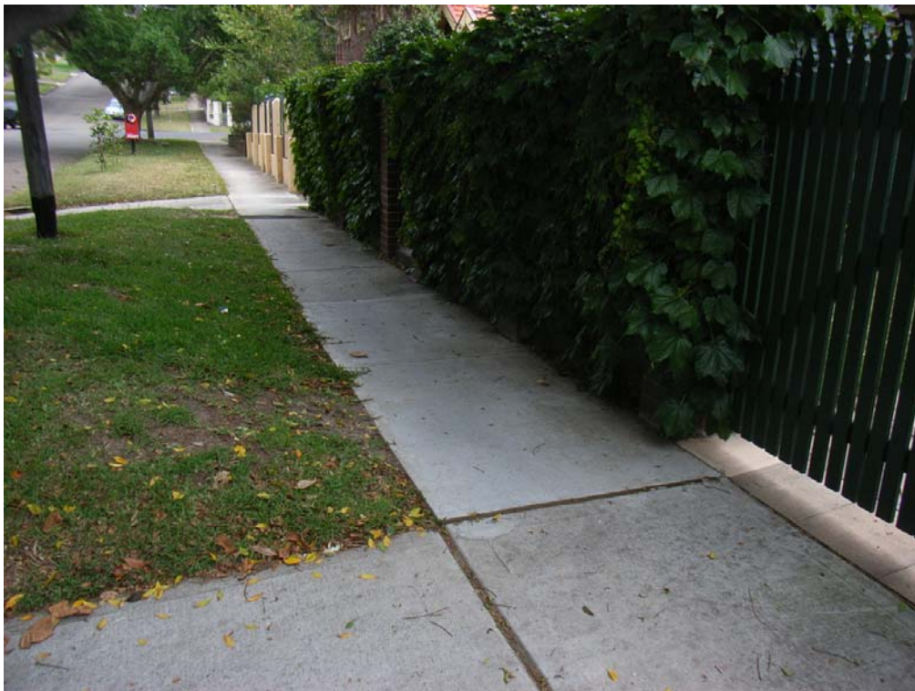
Recently replaced footpath and driveway slab