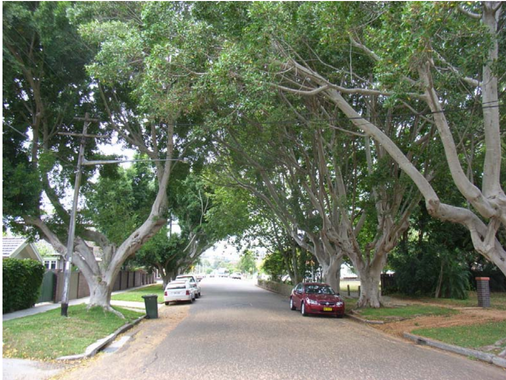
Tree is one of eight in particular section of Day Avenue