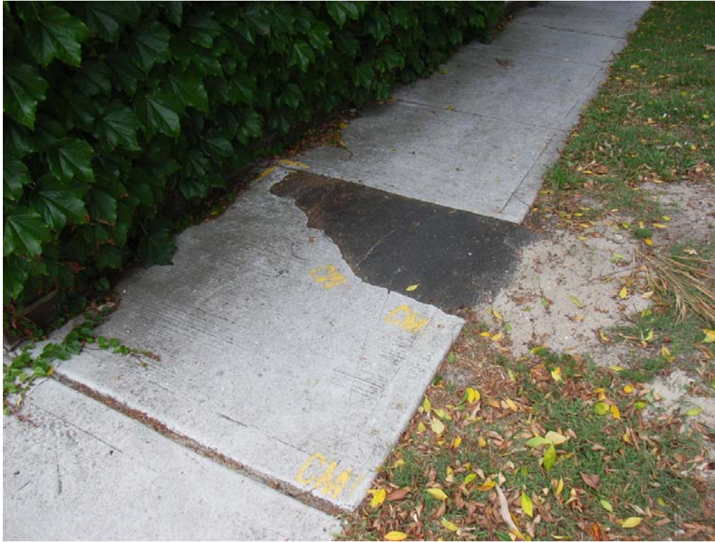
Damaged footpath recently patched because of root damage