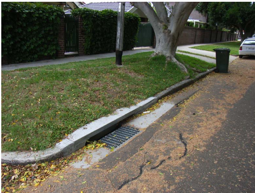
Recently replaced stormwater lintel and roots in roadway